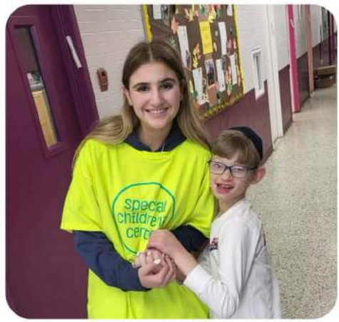
We have the Best Visitors: HAFTR