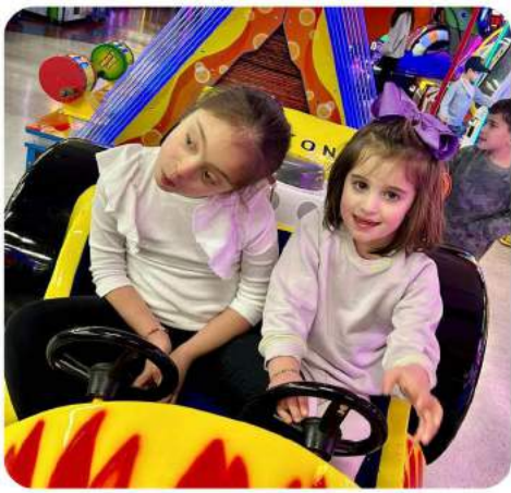
Funtopia with Five Towns