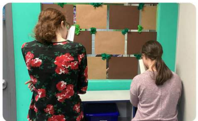
Collaborative Kosel Projects in Jersey and Brooklyn