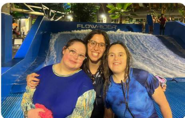
Kartrite Shabbaton Experience